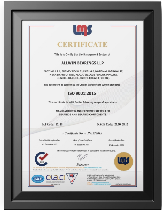
ISO 9001 : 2015